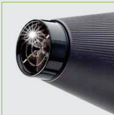
Nano Silver Technology